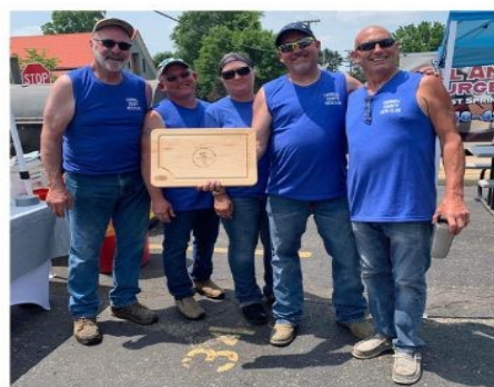
2nd Place Carrollton Vet's Club