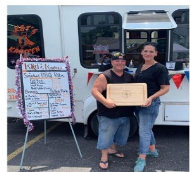
3rd Place K & T's Kanteen