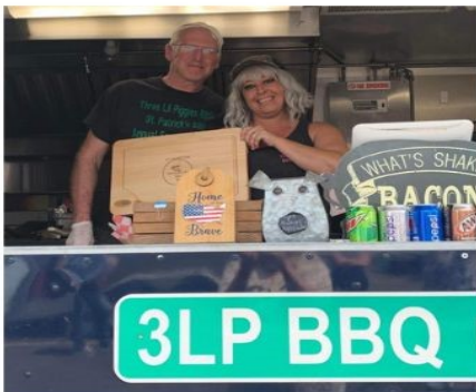
1st place 3Lil Piggies